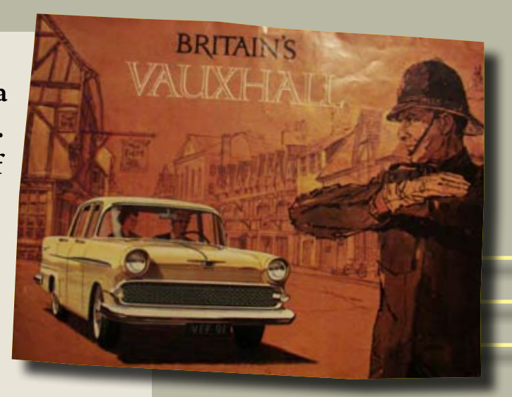
1959 Vauxhall Victor sales brochure for the North American market.

U.S. Vauxhall memorabilia is pretty scarce. This is a 1958 printing plate for a letterpress, a very rare piece. I flipped it and adjusted the color so you could see it better. This was for a newspaper advertisement.