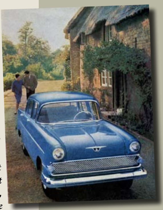
Ads almost always depicted people behind the cars and not in them, so the car would appear larger.