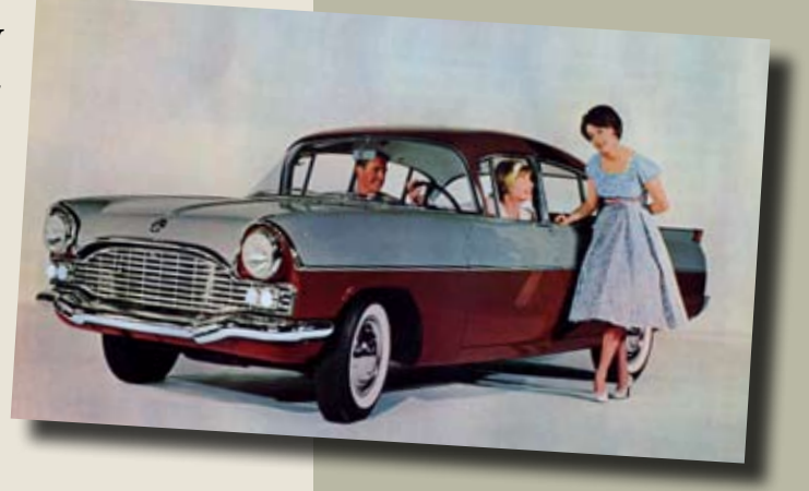
1960 Vauxhall Cresta.