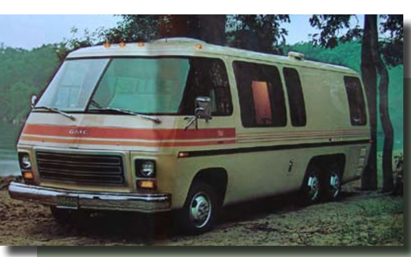
GMC promotional photo showing Motor Home at Burlington Municipal Beach in Vermont.