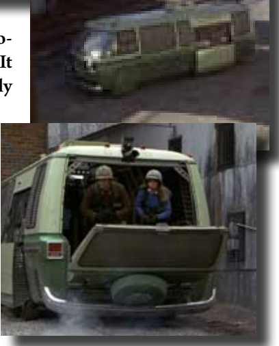
The EM-50 Urban Assault Vehicle.

able points when going into combat. It also featured a fully equipped communications and navigation suite. Designed to prowl urban areas without attracting attention, the EM-50 could quickly deploy its weapons before an enemy knew it was there, or realized what it was. If you have