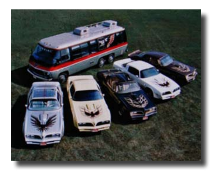
Pontiac's GMC Motor Home with five 1978 Trans Ams.

Pontiac owned one of the Motor Homes and used it as part of their "Trans Am Territory" program. Trans Am Territory was a special space set aside at various race events around the country where Trans Am and Firebird owners could park their cars and socialize. The first time this took place was at Road America, Elkhart Lake, WI. June 5th and 6th 1976. Participants often got discounts and a parade lap around the track. The GMC was dubbed the "Trans Am Traveler" and was at each event, often with a display of Trans Ams and Firebirds. These events also took place at Mid Ohio, Riverside, Laguna Seca, Pocono and other locations. Trans Am and Firebird enthusiast, as well as Firebird clubs would attend in great numbers. At its peak as many as 325 cars would attend. The April 1982 issue of Thunder Am Magazine had a short story about Trans Am Territory and how it needed to be saved by enthusiast writing let-