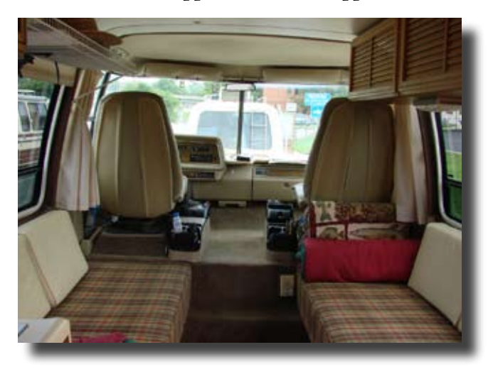
Interior view of a GMC Motor Home showing one of the many configurations offered.

A prototype was first displayed in May 1972 at the Transpro '72 trade show in Washington DC. Production models were first offered as 1973 models. Assembly of the new motor home took place in Pontiac, Michigan at a facility just west of the main truck plant. This was an older facility with a two level layout. The chassis was assembled on the lower level while the body was assembled on the upper floor and dropped down to